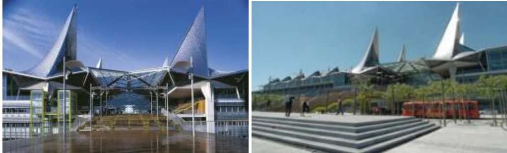
The Court of Justice The Butterfly Palace