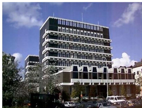
The Court of Appeal