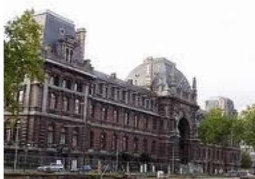
The Assise Court